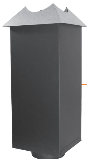
DTP-RCS shown with standard Square-to-Round Collar

That's what you get with the DTP Reduced Clearance Ceiling Support for use with DuraTech Premium insulated chimney.